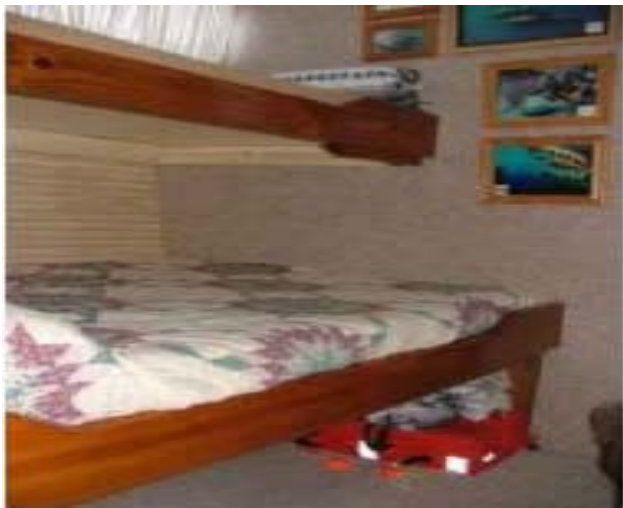
Comfortable Air Conditioned Berths