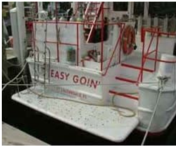
62ft of Diving Pleasure