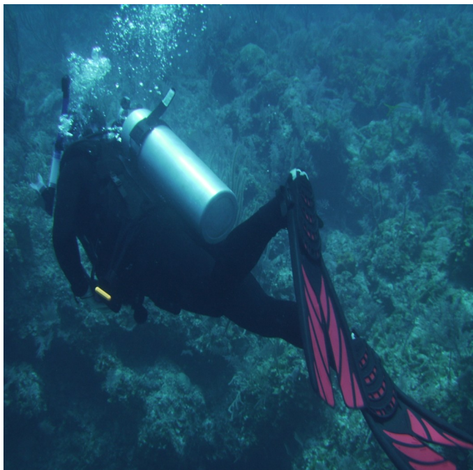
Easy Hour Long Drift Dives and Clear waters