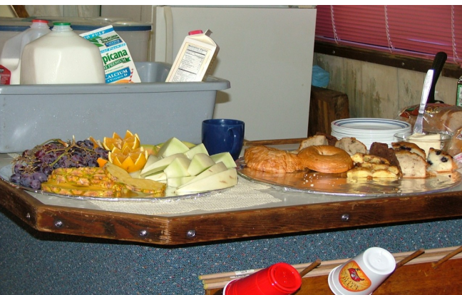
Dining Area with Gourmet Meals and Snacks